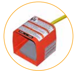
The Foot Switch permits dies to be "jogged" into position and keeps both hands free