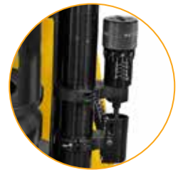
Electronic Stop Switch shuts the pump off when the crimp cycle is complete