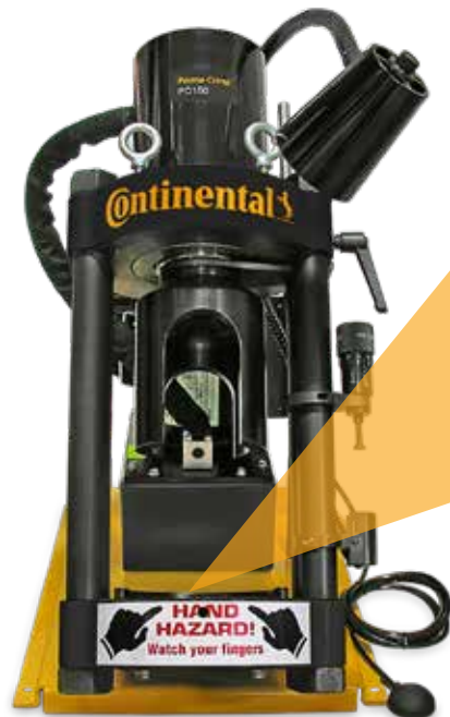
PC150 Double Angle dies