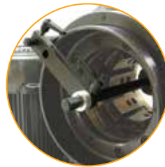
Manual back stop speeds multiple crimps of the same hose and fitting