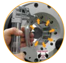
Easy grease maintenance through the 8 lubrication fittings