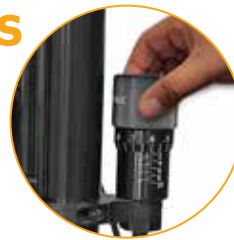
Micrometer is fully adjustable for a precise crimp