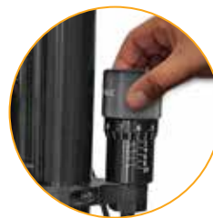
Micrometer is fully adjustable for a precise crimp