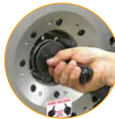
Quick change tool makes die changes a quick and simple process