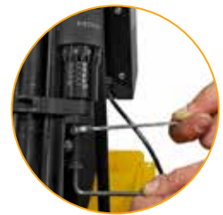
Easy calibration adjustment to increase or decrease the crimp diameter