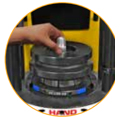
Open design allows the operator to accurately position the fitting prior to crimping