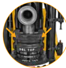
PC150 Spacer Kit ideal for crimping extra long elbow fittings