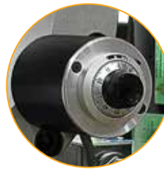
Dial Micrometer is fully adjustable, provides speed, precision and repeatability