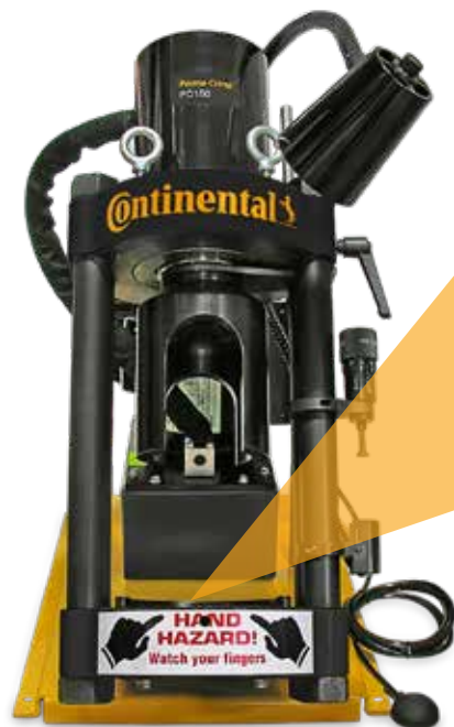
PC150 Standard dies