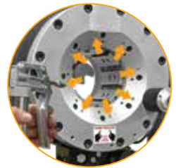
Easy grease maintenance through the 8 lubrication fittings