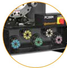
5 die storage pockets panel installed to keep frequently used die sets readily available