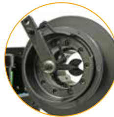
Manual back stop speeds multiple crimps of the same hose and fitting