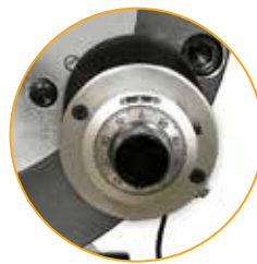
Dial Micrometer is fully adjustable, provides speed, precision and repeatability