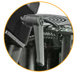
Retraction Stop limits ram retraction for quick repetitive crimps