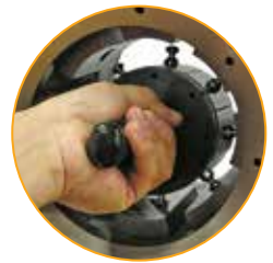
Quick change tool makes die changes a quick and simple process