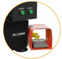
Easy operating control system using Open/Close green push button or the foot switch