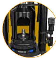
Electronic Stop Switch shuts the pump off when the crimp cycle is complete