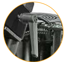
Retraction Stop limits ram retraction for quick repetitive crimps