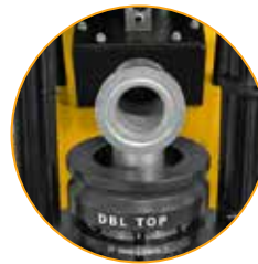
Open design allows the operator to accurately position the fitting prior to crimping