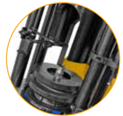
Coupling Stop makes repetitive crimps faster by not having to visually align the fitting before each crimp